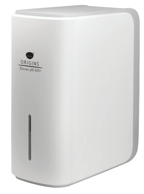
Includes dedicated 3.2 gallon tank and all hardware. Faucet sold separately.

Superior filtration and design puts clear, fresh, great tasting water right at your fingertips. No more guessing what's in your water. Reverse Osmosis works to remove dissolved substances from your water. RO is capable of rejecting: salts, sugars, proteins, dyes, particles, heavy metals, dissolved organics, and disinfectant byproducts. The water is then enhanced by our pH our "Elevate pH filter" leaving your water perfectly balanced for enhanced hydration.